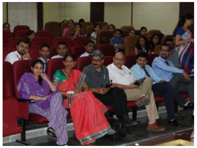
Guest lecture on "Bioentrepreneurial Ecosystem in Gujarat and various grant schemes of central and state government"