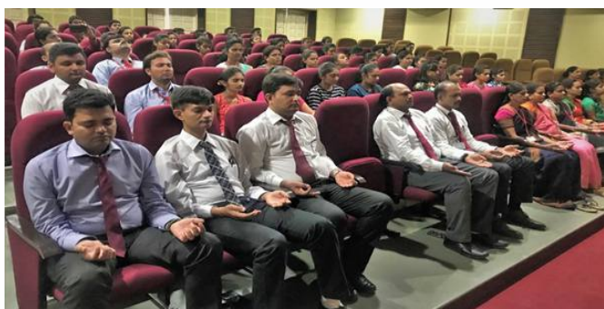
Seminar on sound therapy organized by CWDC committee