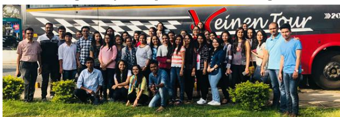
Visit to Physical Research Laboratory, Ahmedabad