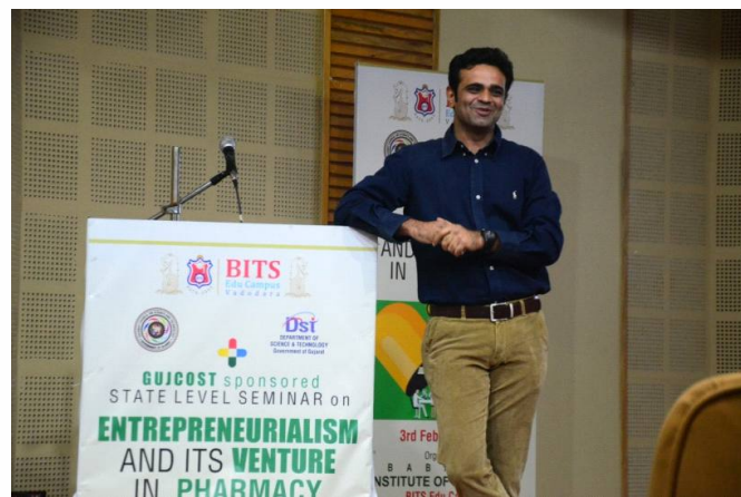
GUJCOST sponsored state level seminar on "Entrepreneurialism and its venture in pharmacy"