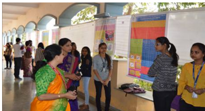
Poster and essay writing competition on the occasion of International Women's Day celebration

To celebrate the women hood and their role in society building an international Women's Day celebration was done on 8th March 2018. The event was organized by Collegiate Women's Development Cell of Babaria Institute of Pharmacy. On this occasion various activities like poster presentation and the essay writing competition on the theme of Women's role in society building was organized. The entire event was celebrated with great enthusiasm and participation by students and faculty members.