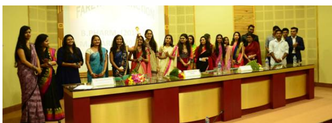
Farewell function "Last Lecture" of final year B.Pharm. and M.Pharm. students