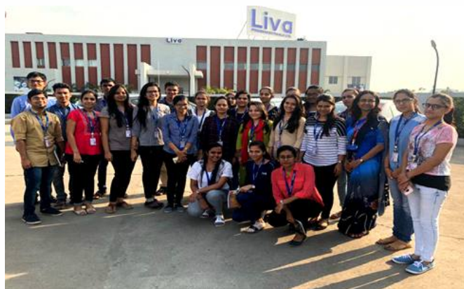
Industry visit to Liva Pharmaceuticals Ltd Halol