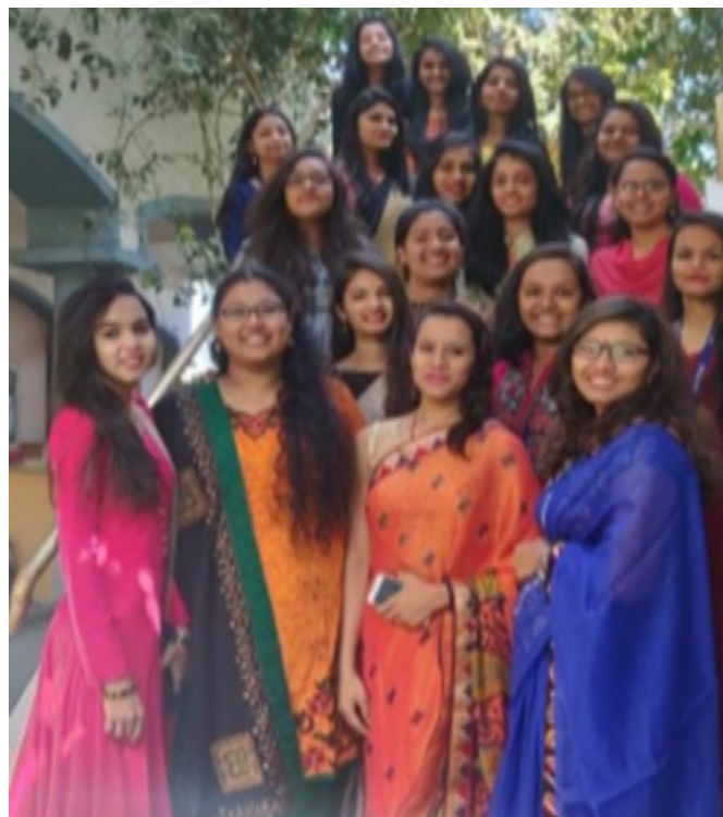
Sport's week and Days celebration

Days celebration has always been very exciting segment of college life for all the students. The management of BITS Edu Campus also allows student to celebrate days for a week every year, during sports week, in which students become creative to show different themes. It includes group day, traditional day, formal day, twins day, mismatch day etc. This celebration gives students memorable moments which they cherish for the lifetime. This year the following days were celebrated at Babaria Institute of Pharmacy with full enthusiasm and all the students enjoyed the celebration and bonded well with each other. Students and faculties took part in various sports activities too and winners were awarded and appreciated by management with trophy and certificates. Overall the entire week was full of energy and enthusiasm.