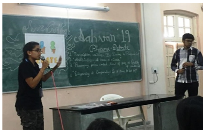
AAHVAN 2019, GTU Tech fest - Zone 3