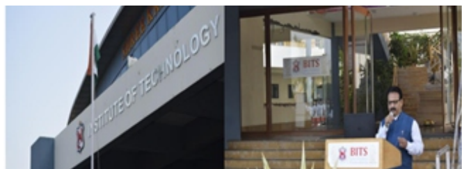
Republic day celebration