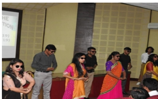
Farewell Function of B.Pharm 8th semester and M.Pharm 4th semester students