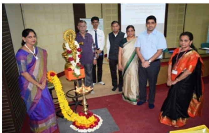
GUJCOST sponsored National seminar on "Novel Drug Delivery System in Healthcare Management: Status and Challenges"