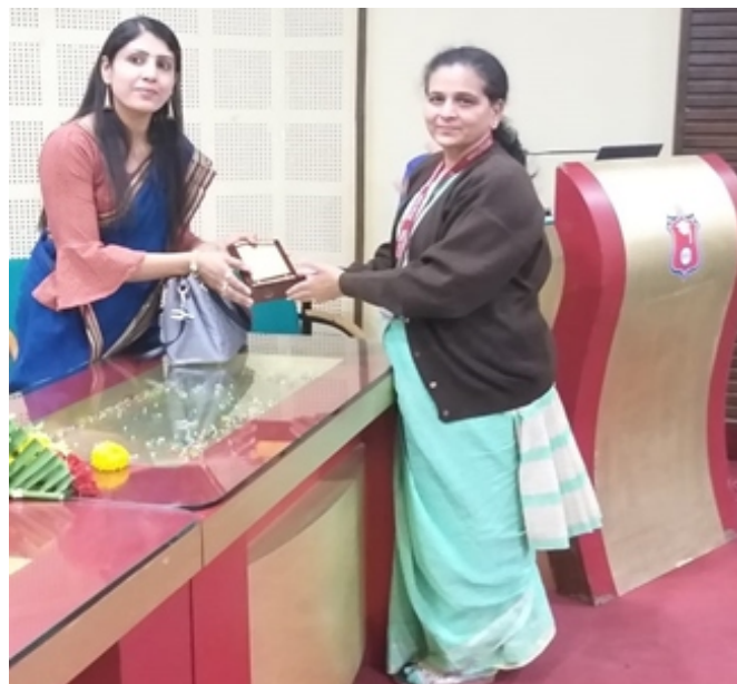
CWDC organized guest lecture on "Awareness on women's health - Menstrual irregularities and obesity"