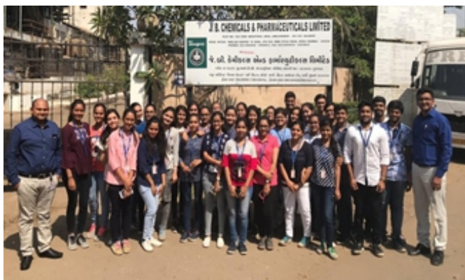
Industry visit to J. B. Chemicals and Pharmaceuticals Ltd. Ankleshwar