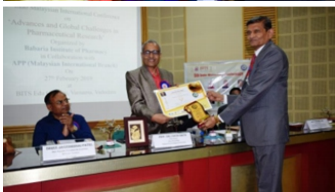
5th Indo Malaysian Conference