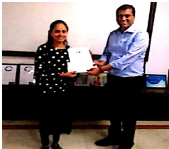
Award presenting ceremony of Schott Fiolax 2018 scholarship program