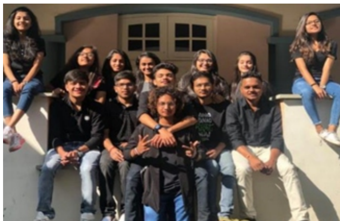
Sport's week and Days celebration