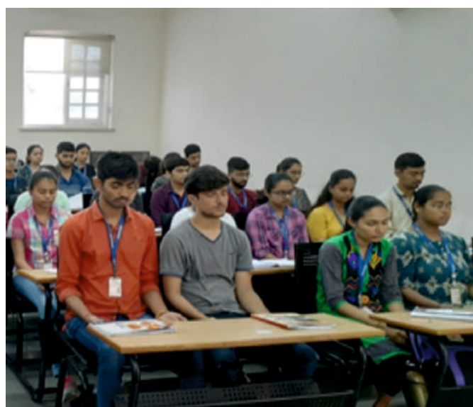
Fit India Movement