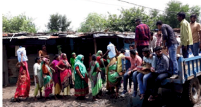
Contribution of Large Water Jar in Flood Affected Areas of Vadodara on 13th August 2019 initiated by NSS UNIT-BIP