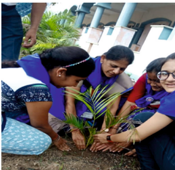
Tree Plantation by students and BIP staff