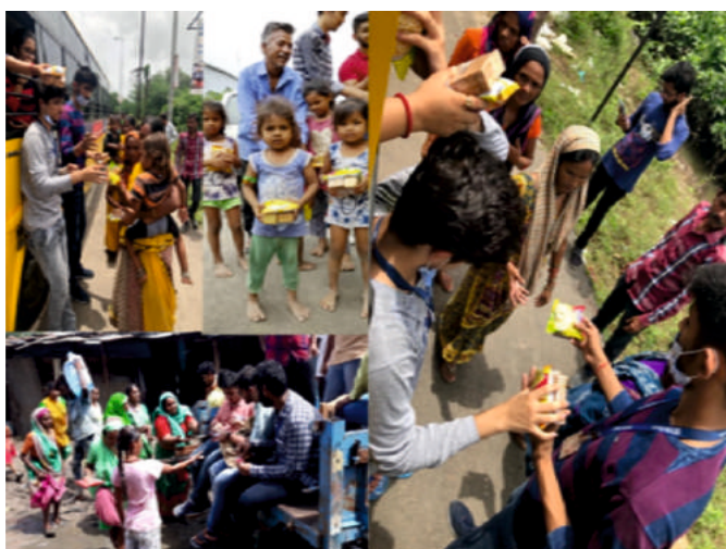
Contribution of Food Packets in Flood Affected Areas of Vadodara on 13th August 2019 initiated by NSS UNIT-BIP