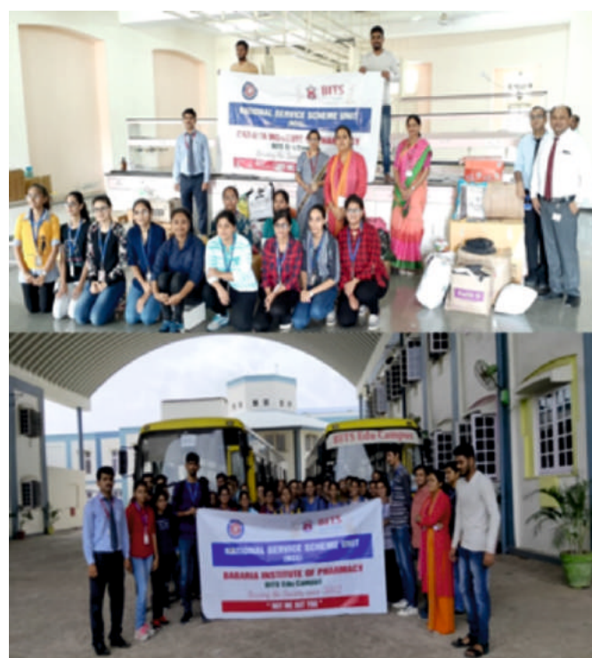
Preparedness of NSS Unit-BIP for "Contribution of Flood Affected Areas in Vadodara" on 13th August 2019