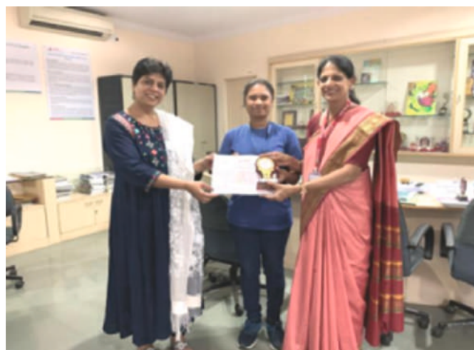
CWDC, APTI Sponsored event on awareness of women health and women empowerment

Due to the heavy rainfall in the first week of August in Vadodara city and surrounding area, there was a flood like situation in many parts of the city. In some areas the situation was so grim that people were not having basic needs like food, water and clothes. The NSS unit of Babaria Institute of Pharmacy collected relief materials with the help of student volunteers and distributed it to needy poor people. Food packages, water bottles and clothes were distributed to Kalali, Vadsar and Makarpura village area, affected by the flood. Overall this entire exercise was hugely successful and it was an indeed satisfying experience for everyone.