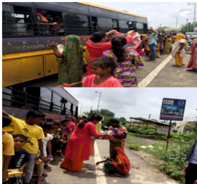
Contribution of Clothes in Flood Affected Areas of Vadodara on 13th August 2019 initiated by NSS UNIT-BIP