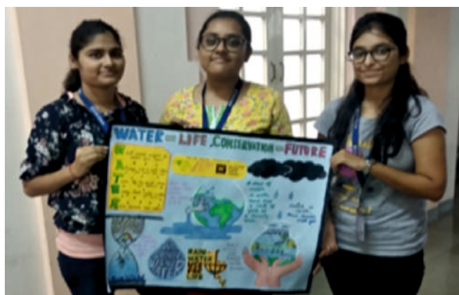
Jal Shakti Abhiyan celebration