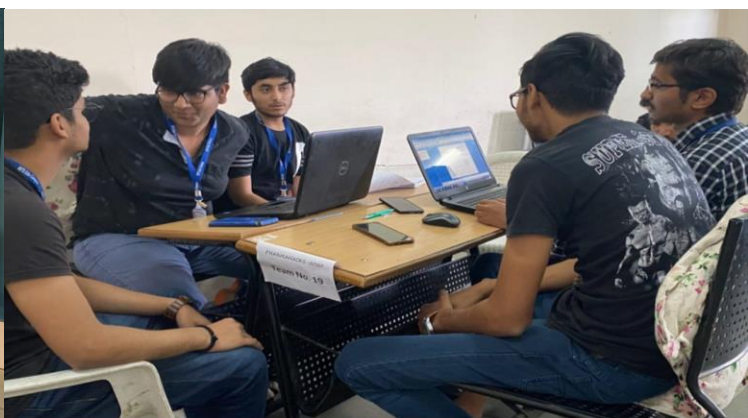
Late night Discussion amongst students with refreshment facility