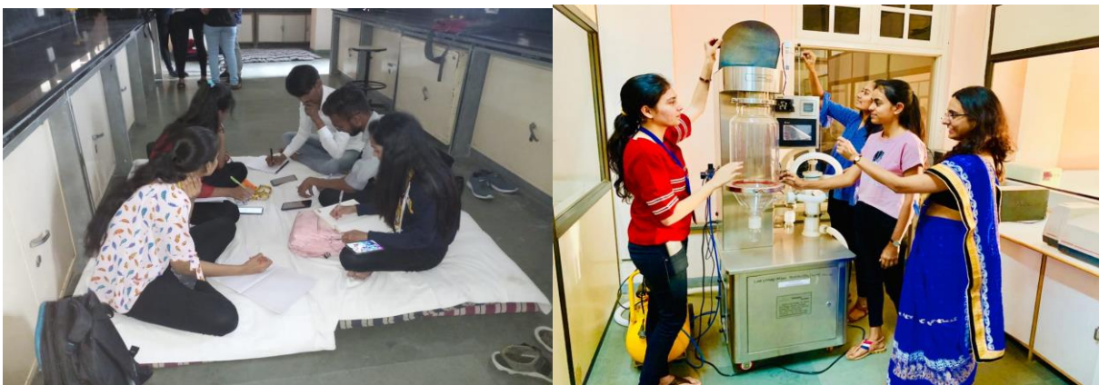
Early morning research work by students and mentors

The second day started with early morning breakfast and tea. Participants started summarizing their findings in the form of presentation. Power Judging started at 2:45 PM and for the final pitch, 7 minutes of time was given per team, 4 minutes for explanation, 3 minutes for Q & A.