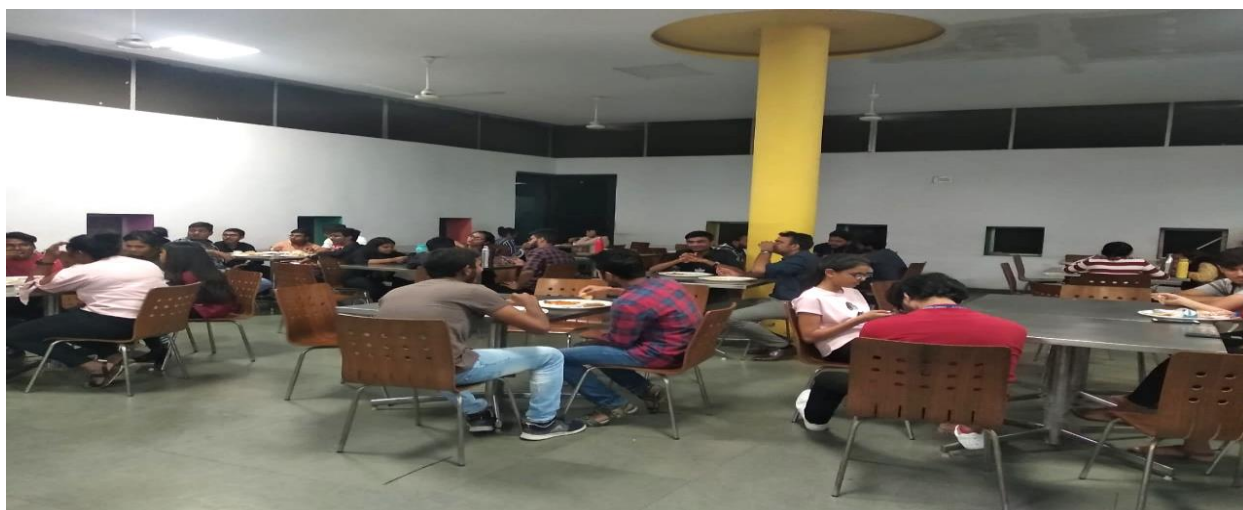
Dinner in cafeteria of BITS Edu Campus