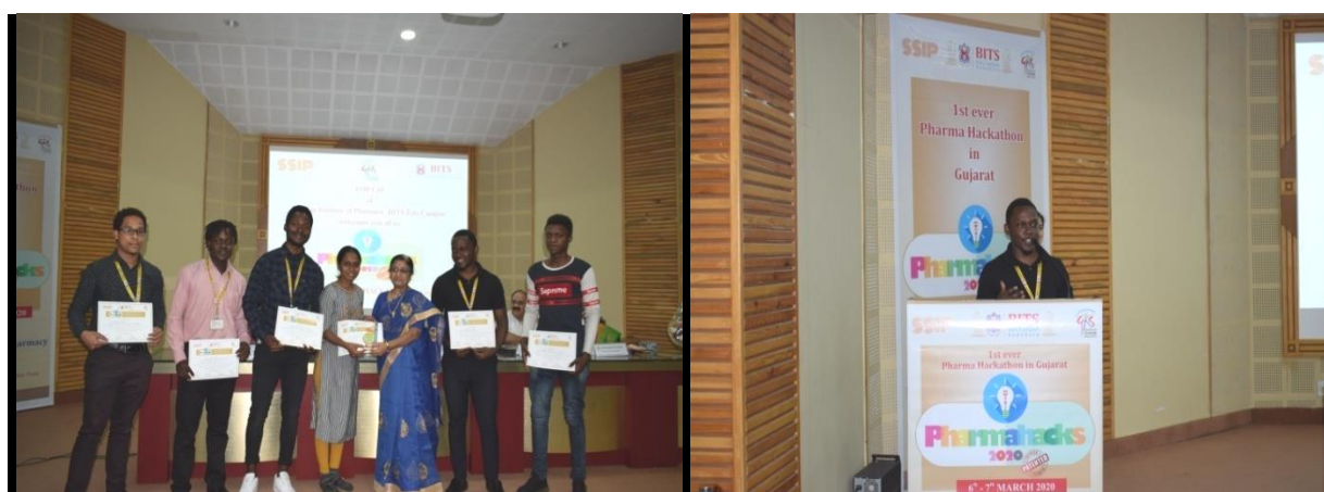
Prizes distribution to winners of Pharmahacks-2020 and participant feedback