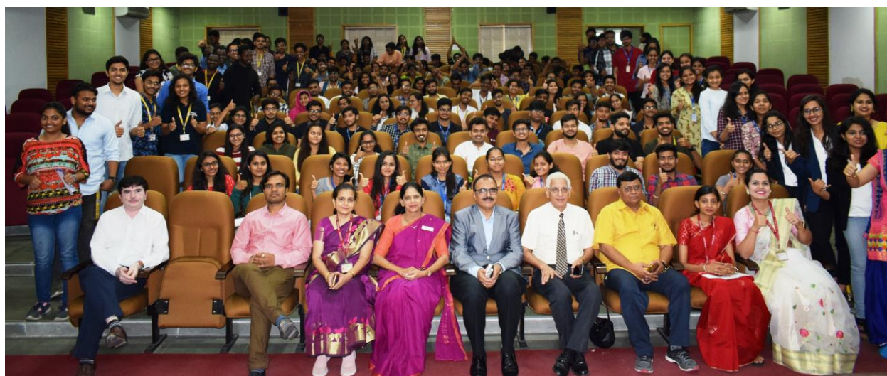
Audience at Inaugural ceremony of Pharmahacks-2020