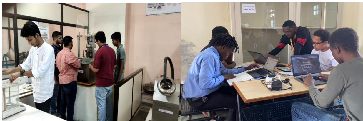
Problem solving work by students and mentors