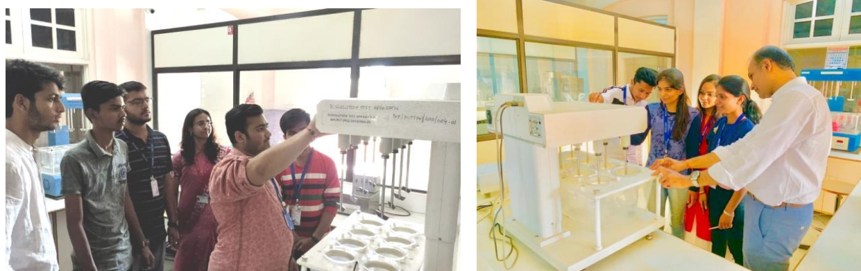
Problem solving work by students and mentors

After reporting of the teams on 6 th March, morning, problem solving work started by the participants for the next thirty six hours. The problem statements were Management of chronic diseases, Next generation pharma revolution and alternative therapies for disease management.