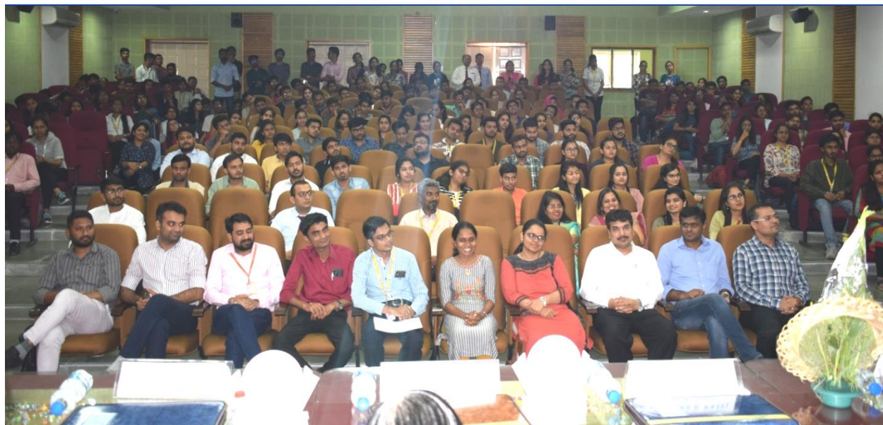
Participants, mentors and jury of Pharmahacks-2020