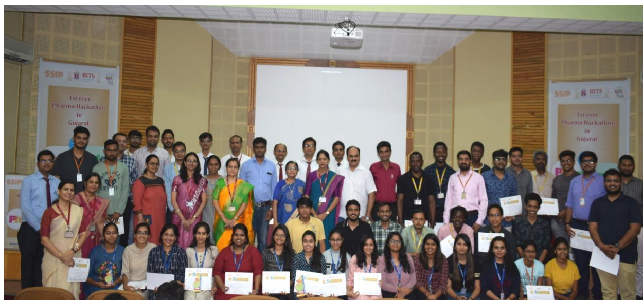
Winners and mentors of Pharmahacks-2020 along with jury and guests