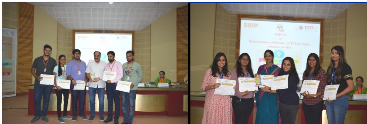
Prizes distribution to winners of Pharmahacks-2020