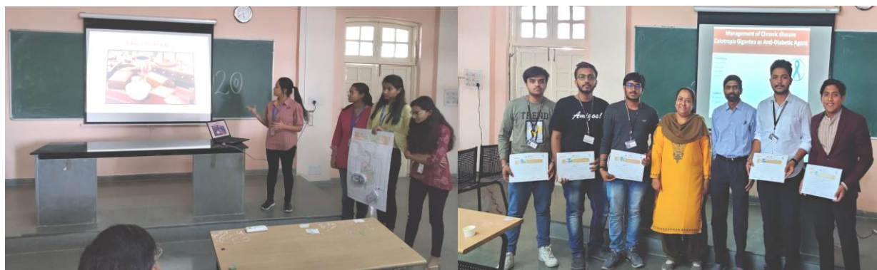
Jury Round by Industry experts