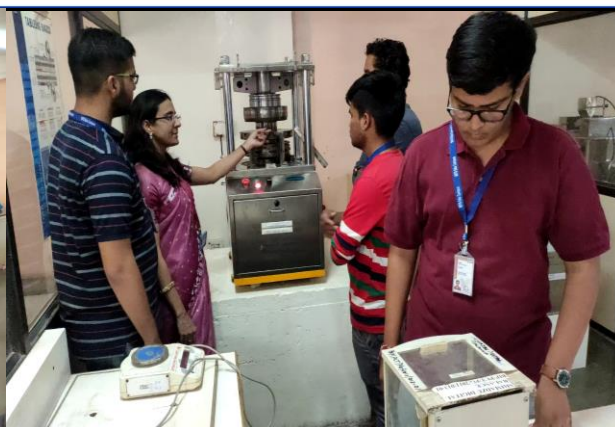
Problem solving work continues...